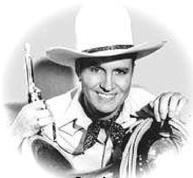
Gene Autry Public Cowboy #1